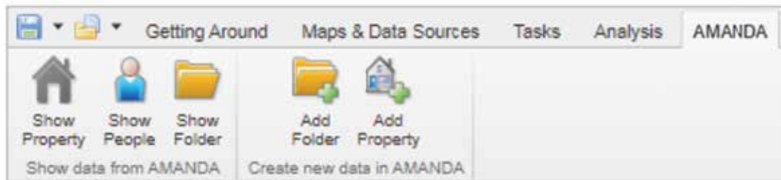
The AMANDA tab of the toolbar in the Geocortex Viewer for Silverlight